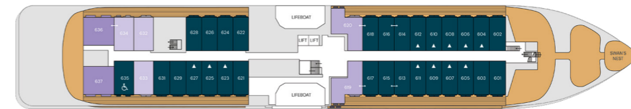
Deck 6 Premium Suites Suites Junior Suites Balcony Staterooms Swan's Nest