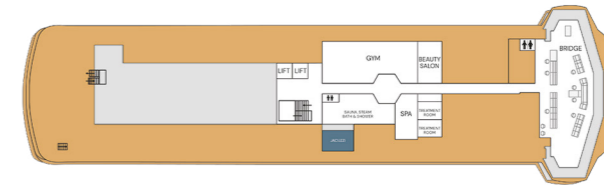
Deck 8 Gym Sauna Jacuzzi Spa Beauty Salon Bridge