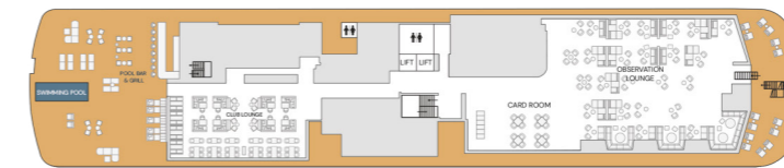
Deck 7 Swimming Pool Pool Bar & Grill Club Lounge Card Room Observation Lounge