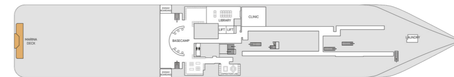
Deck 3 Marina Deck Zodiac Boarding Basecamp Library Expedition Lab Clinic Laundry