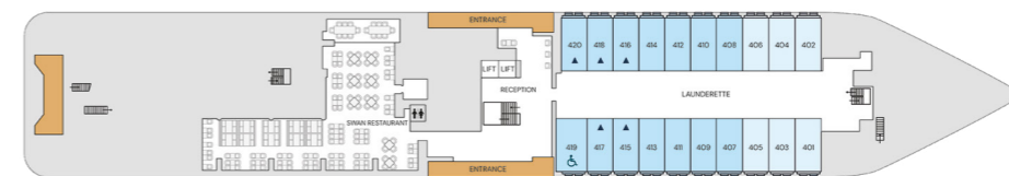
Deck 4 Swan Restaurant Reception Oceanview Staterooms Launderette