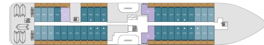
Deck 5 Balcony Staterooms Junior Suites Suites